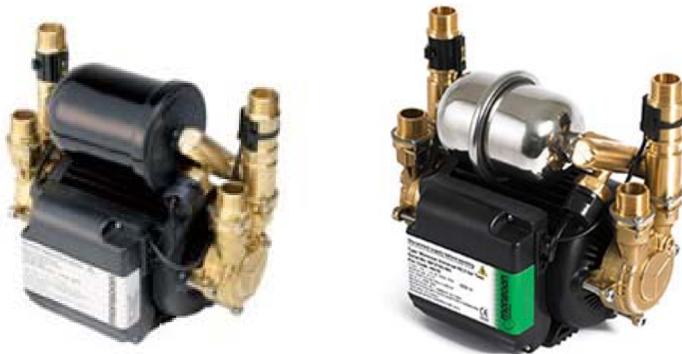
Negative Head Pumps