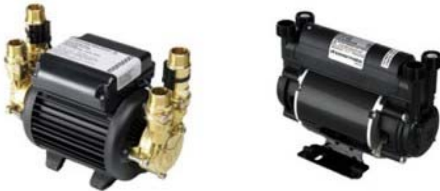
Positive Head Pumps